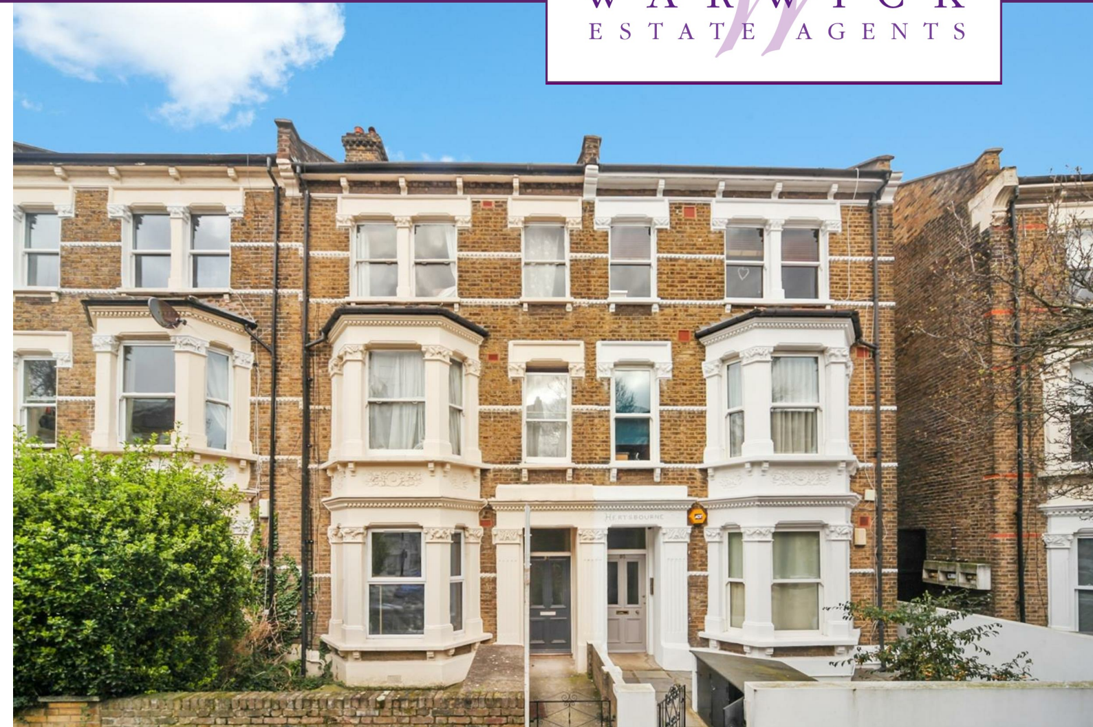
Saltram Crescent, Maida Vale, W9 3JS